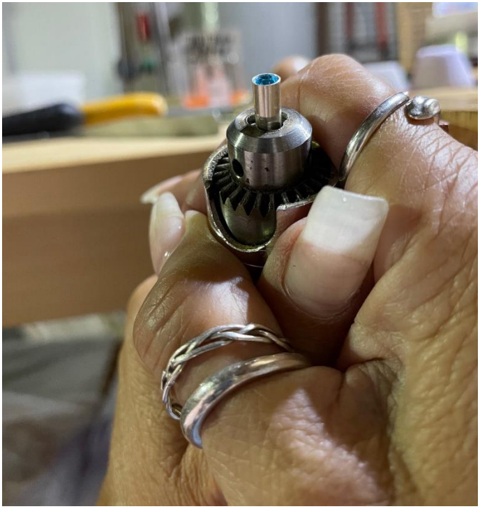
Unlocking the potential of the flex shaft.

hammering, cutting, polishing and other attachments can improve your work and streamline your workflow.