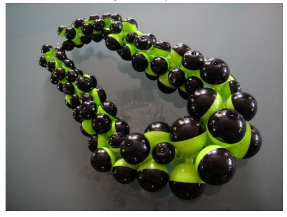
Edward Lane McCartney, Gone Fishing II, 2011. Fishing floats, steel, sterling silver.

Beeville Art Museum , 401 E. Fannin, Beeville, TX, 78102. Restoration showcases Edward's collages, assemblages, jewelry, and sculpture, created from found objects drawn from everyday life, celebrates finding beauty in the overlooked.