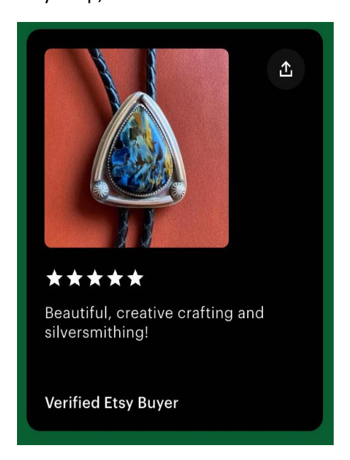
One of many rave reviews for Beverly's work.