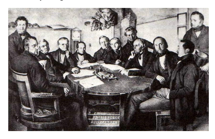
HMAG's first Board of Directors.

By the time you receive this newsletter, HMAG Board Elections will be right around the corner. If you appreciate HMAG and all the benefits of a local live guild, please consider joining the Board for 2025-2026.