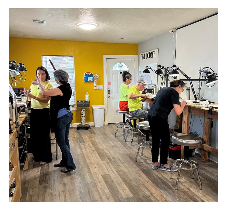
Big Bling workshop in progress.

Later, following their own tastes and designs, class members had the opportunity to customize and embellish this generously-sized canvas through texturing, adding stones, and so on. By the end of the workshop, several students had permanently lost their fear of making big rings and were eager to move on from dainty little stacks.