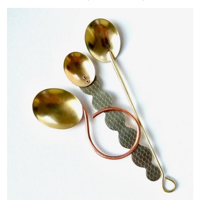
Fabricated spoons in brass, copper, and nickel, by Corey Ackelmire.

(Sponsored by HMAG and held at Charisma Design Studios.) In this workshop, Corey will teach participants how to fabricate spoons. She will cover using the hydraulic press to form the spoon bowl, as well as explore different fabrication options for the spoon handle.