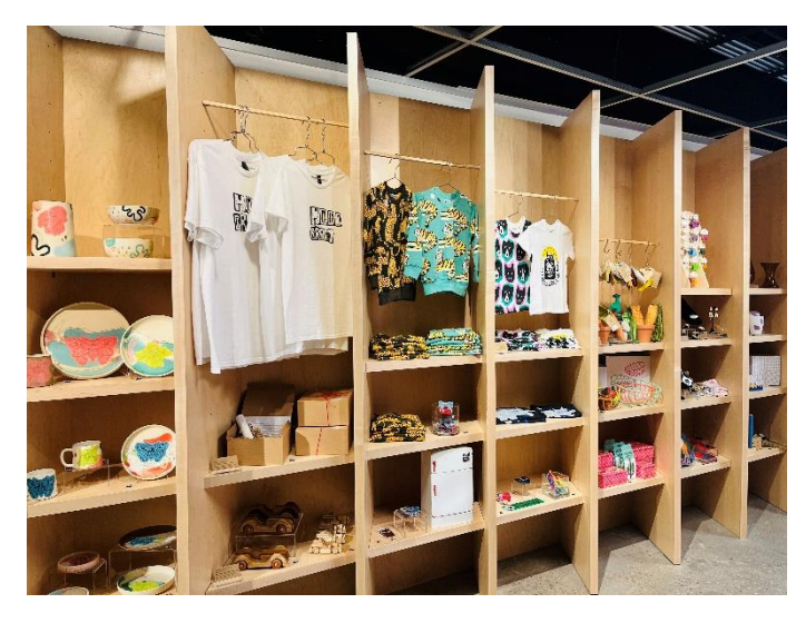
Versatile lenticular shelving maximizes space and flexibility at Asher: Off the Wall.

KT: I love trying to learn what our visitors' buying behaviors are, but finding the sweet spot for price points is definitely a moving target! (While there are more expensive items), I have found that the $30-$90 range makes fine craft more accessible. We want everyone to have craft in their everyday lives.